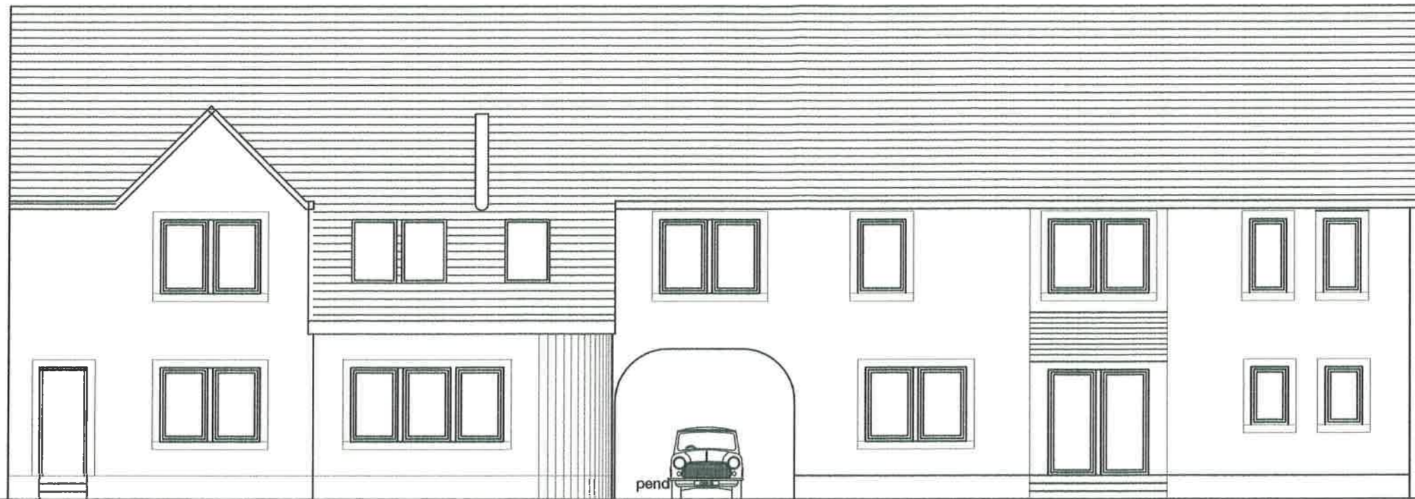
15 Jubilee Terrace